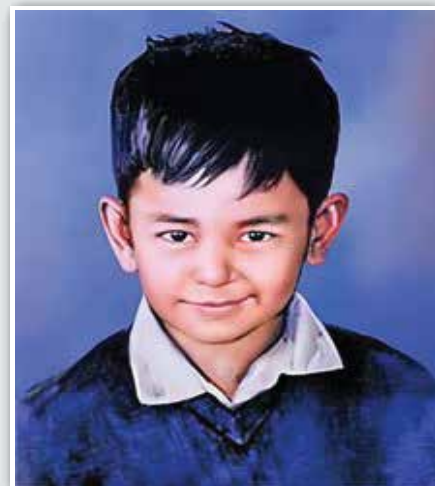
Sheikh Russel , The youngest son of Bangabandhu Sheikh Mujibur Rahman